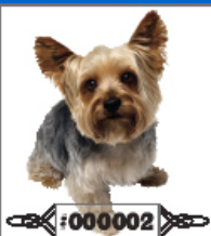
#2 Yorkshire Terrier:

Direct and dependable, these hard-working hounds are loving and loyal.