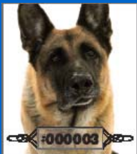
#3 German Shepherd:

Super smart and easy-going, friendly Golden Retrievers strive to satisfy.