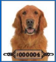
#4 Golden Retriever:

Happy-go-lucky and sociable, these comedic canines just love to make their companions smile.